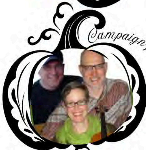
Campaign for Real Time