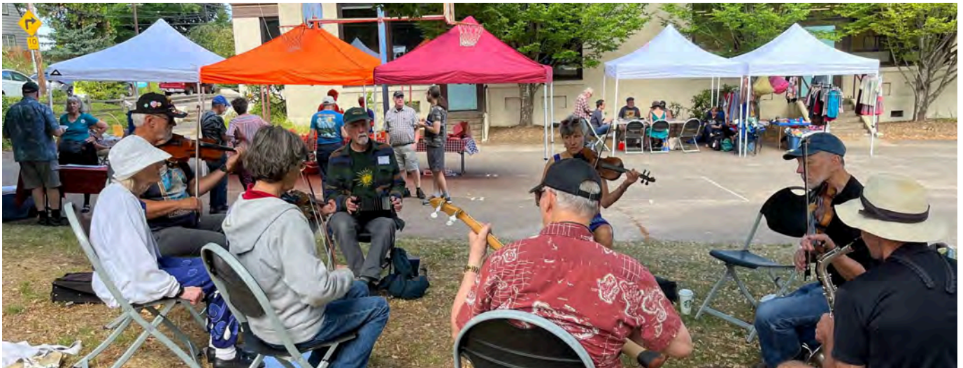
Foreground: Picnic-goers jam and socialize. Background: People check out games, food, and the clothing exchange.

Here's to more community building and co-creating! 🍁